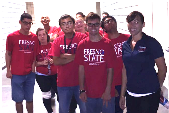
Above: Students waiting in the tunnel at Save Mart Center to have their names announced at the Volleyball Game.

We have had our busiest semester yet of students attending activities, from open-air concerts to self-defense workshops to a SF Giants v LA Dodgers game. One of our students' great loves is taking pride in supporting their Bulldogs at all major sporting events that Fresno State competes in. Back in November however it was our students turn to be on the receiving end of support, when the Fresno State Women's Volleyball team wanted to show their gratitude by inviting our students onto the court at half time to personally thank them. Students got to run out onto the court, while getting their names announced over the loud speaker to a chorus of cheers from the crowd. It really was a major highlight of the last semester.